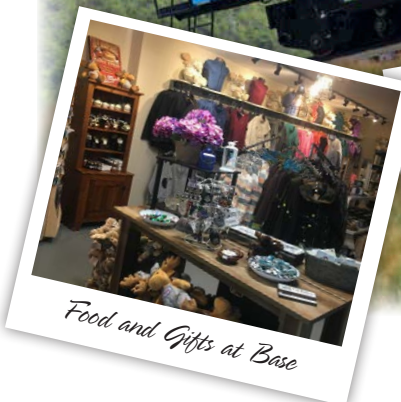
Food and Gifts at Base