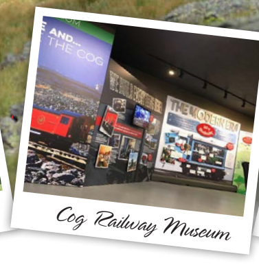
Cog Railway Museum