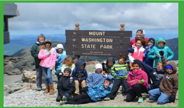
An amazing trip in spring, summer or fall!