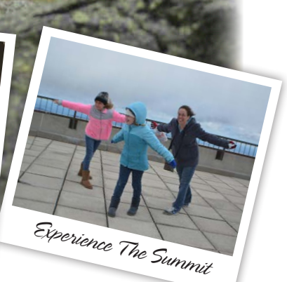
Experience The Summit