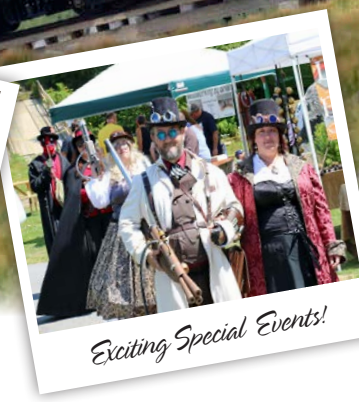
Exciting Special Events!