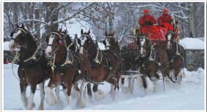
The Rocks' spectacular scenery perfectly showcased the magnificent Budweiser horses in a recent promotional photoshoot.