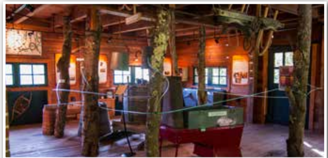
The New Hampshire Maple Experience is an informative tribute to this sweet treat. Visitors learn about the syrup-making process and its history. Run in cooperation with the New Hampshire Maple Producers Assoc.