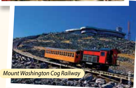
Mount Washington Cog Railway