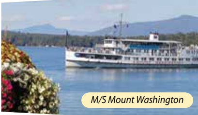
M/S Mount Washington