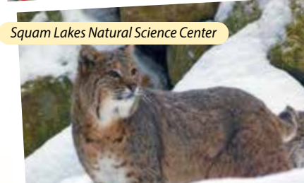
Squam Lakes Natural Science Center