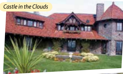
Castle in the Clouds